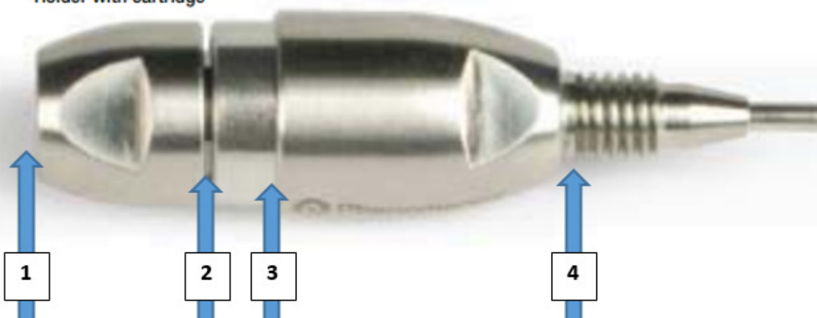
Holder with cartridge

If you need further clarification, please review the SecurityGuard ULTRA Installation instructions.